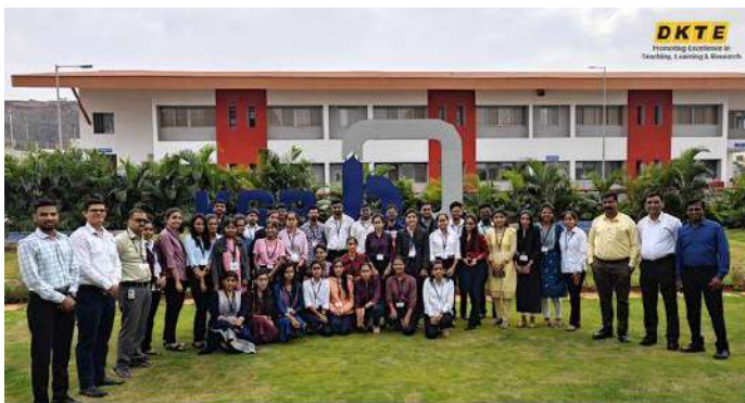
DKTE Society's TEXTILE AND ENGINEERING INSTITUTE, ICHALKARANJI