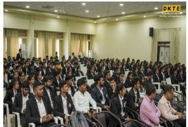
DKTE Society's TEXTILE AND ENGINEERING INSTITUTE, ICHALKARANJI Rajwada, P.O.Box. No.130, Ichalkaranji, Dist: Kolhapur. Toll Free No : 1800 843 1300 www.dkte.ac.in