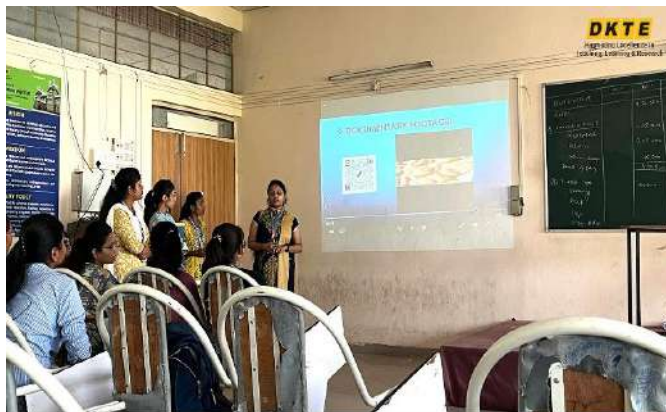
DKTE Society's TEXTILE AND ENGINEERING INSTITUTE, ICHALKARANJI Rajwada, P.O.Box. No.130, Ichalkaranji, Dist. Kolhapur. Toll Free No : 1800 843 1300 | www.dkte.ac.in