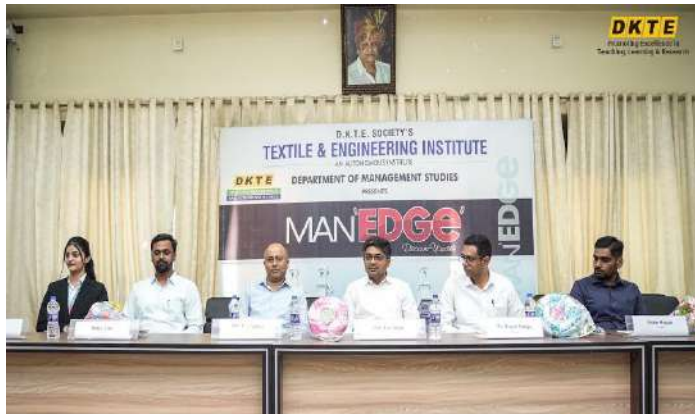
DKTE Society's TEXTILE AND ENGINEERING INSTITUTE, ICHALKARANJI Rajwada, P.O.Box. No.130, Ichalkaranji, Dist: Kolhapur. Toll Free No : 1800 843 1300 www.dkte.ac.in

All the sponsors, co-sponsors were present on this occasion. Around 205 students from various Management institutes of Sangli, Satara, Belagavi and Kolhapur districts participated in the event.