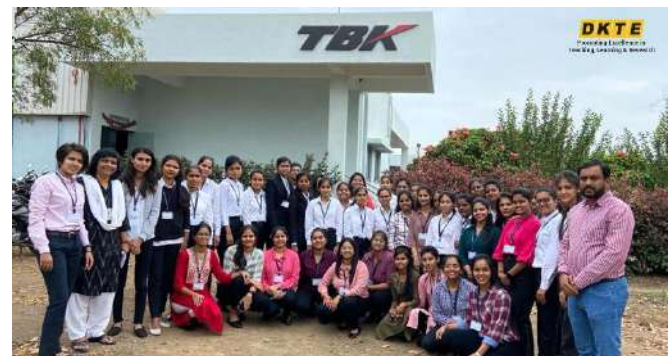
DKTE Society's TEXTILE AND ENGINEERING INSTITUTE, ICHALKARANJI

Rajwada, P.O.Box, No.130, Ichalkaranji, Dist. Kolhapur. Toll Free No : 1800 843 1300 www.dkte.ac.in