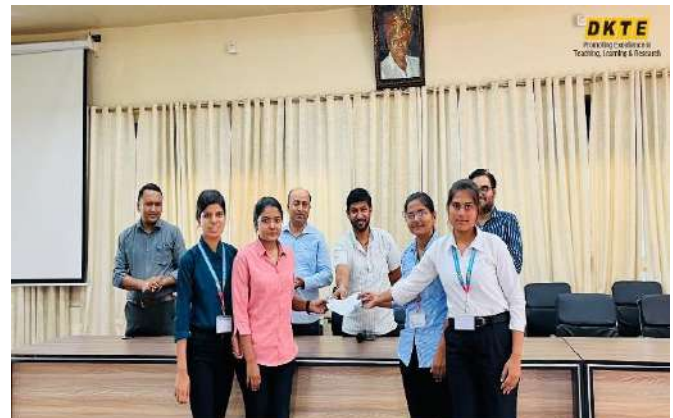
DKTE Society's TEXTILE AND ENGINEERING INSTITUTE, ICHALKARANJI Rajwada, P.O.Box. No.130, Ichalkaranji, Dist. Kolhapur. Toll Free No : 1800 843 1300 | www.dkte.ac.in